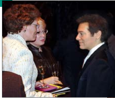
Michael Feinstein and admirers.

The ARTS by George! evening held on Saturday, Sept. 30, was a rousing success. Senator and Mrs. John Warner co-chaired the event, a scholarship benefit supporting student scholarships in the College of Visual and Performing Arts. Guests enjoyed cocktails on the Performing Arts plaza and food throughout the building while being entertained by Mason students and faculty in a series of presentations highlighting the talents of our Mason performing artists. Following a concert hall performance by Michael Feinstein at the Center, the lucky attendees joined Mr. Feinstein on stage for a champagne and dessert reception. ■