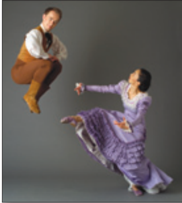
Martha Graham Dance Company

The Martha Graham Dance Company celebrated its 85 th anniversary season at the Center for the Arts on October 11 th . The company, founded by legendary dancer and choreographer Martha Graham (1894-1991), presented an extraordinary evening of American modern dance. The program opened with Prelude and Revolt , a multimedia work that intertwined live performances of Graham's early creations with film clips, photos and narration. The program also presented Lamentation , a soul-baring solo danced to one of Zoltán Kodály's piano scores; Lamentation Variations , a trio of new works inspired by the original piece; and Panorama , which expresses the power of the people to bring about change.